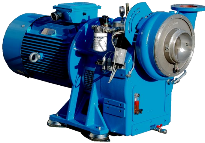
Shown model in console configuration with B5 flanged motor